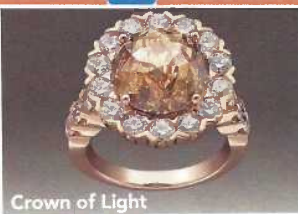
Crown of Light